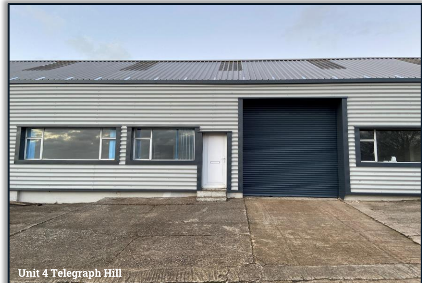
Unit 4 Telegraph Hill

The property is currently assessed within band D (96), full details and copy of certificate available upon request.