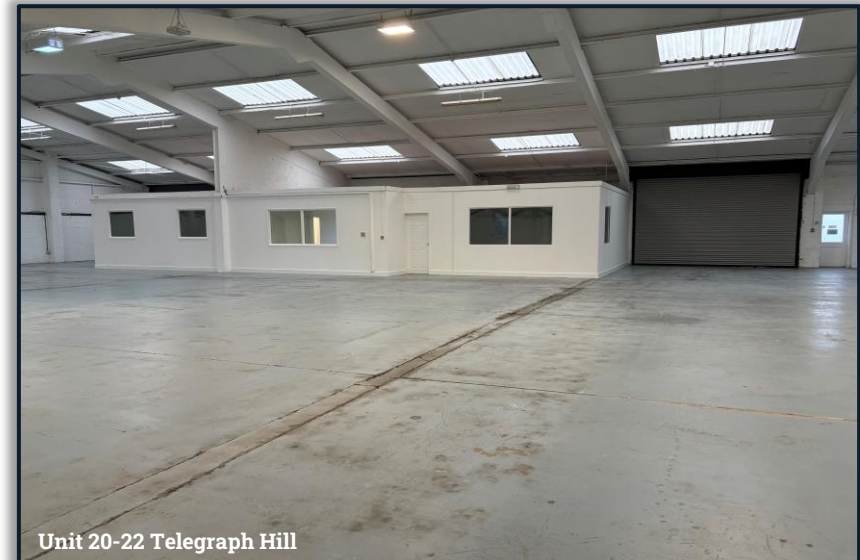
Unit 20-22 Telegraph Hill