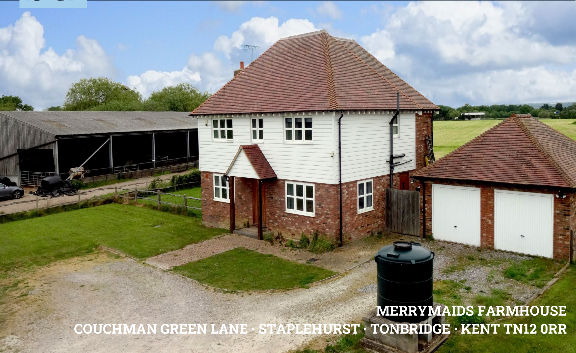
MERRYMAIDS FARMHOUSE COUCHMAN GREEN LANE - STAPLEHURST - TONBRIDGE - KENT TN12 0RR