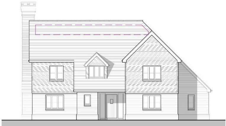
Proposed North-West Elevation 1:100 @ A1