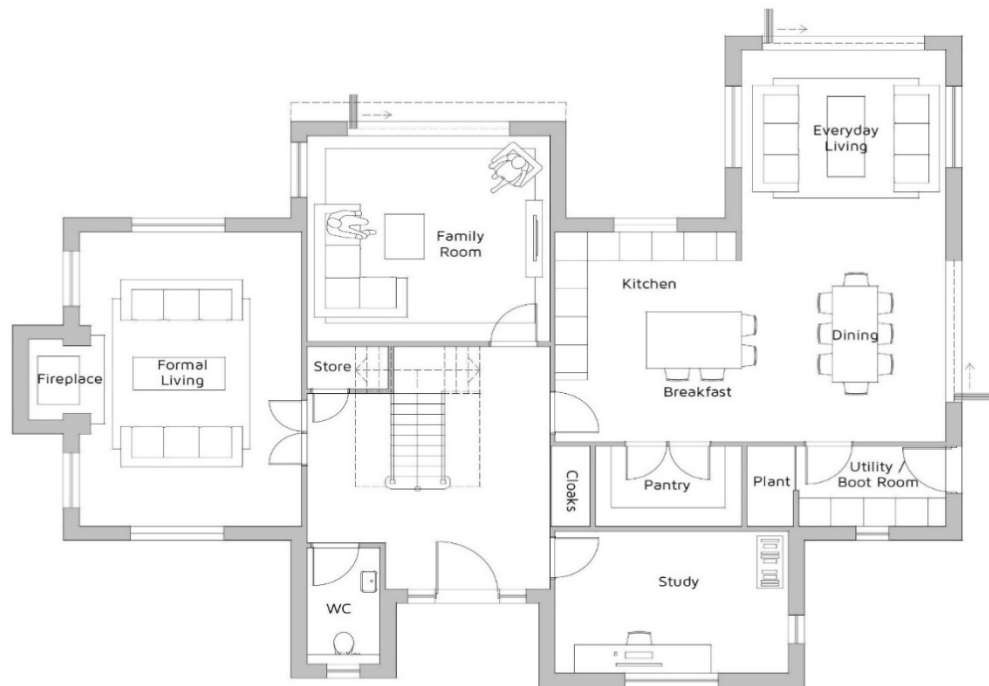
Proposed Ground Floor Plan 1:100 @ A1