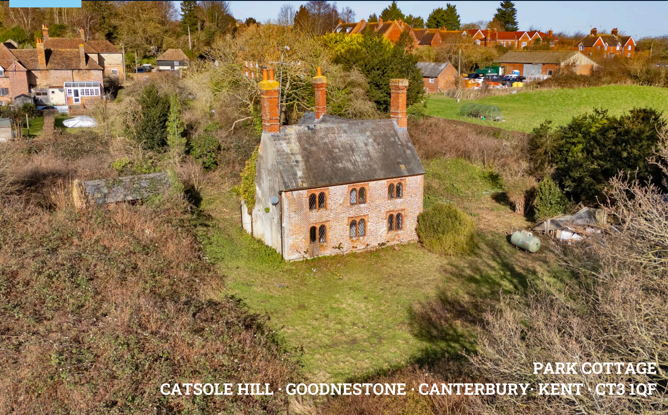
PARK COTTAGE CATSOLE HILL · GOODNESTONE · CANTERBURY · KENT · CT3 1QF