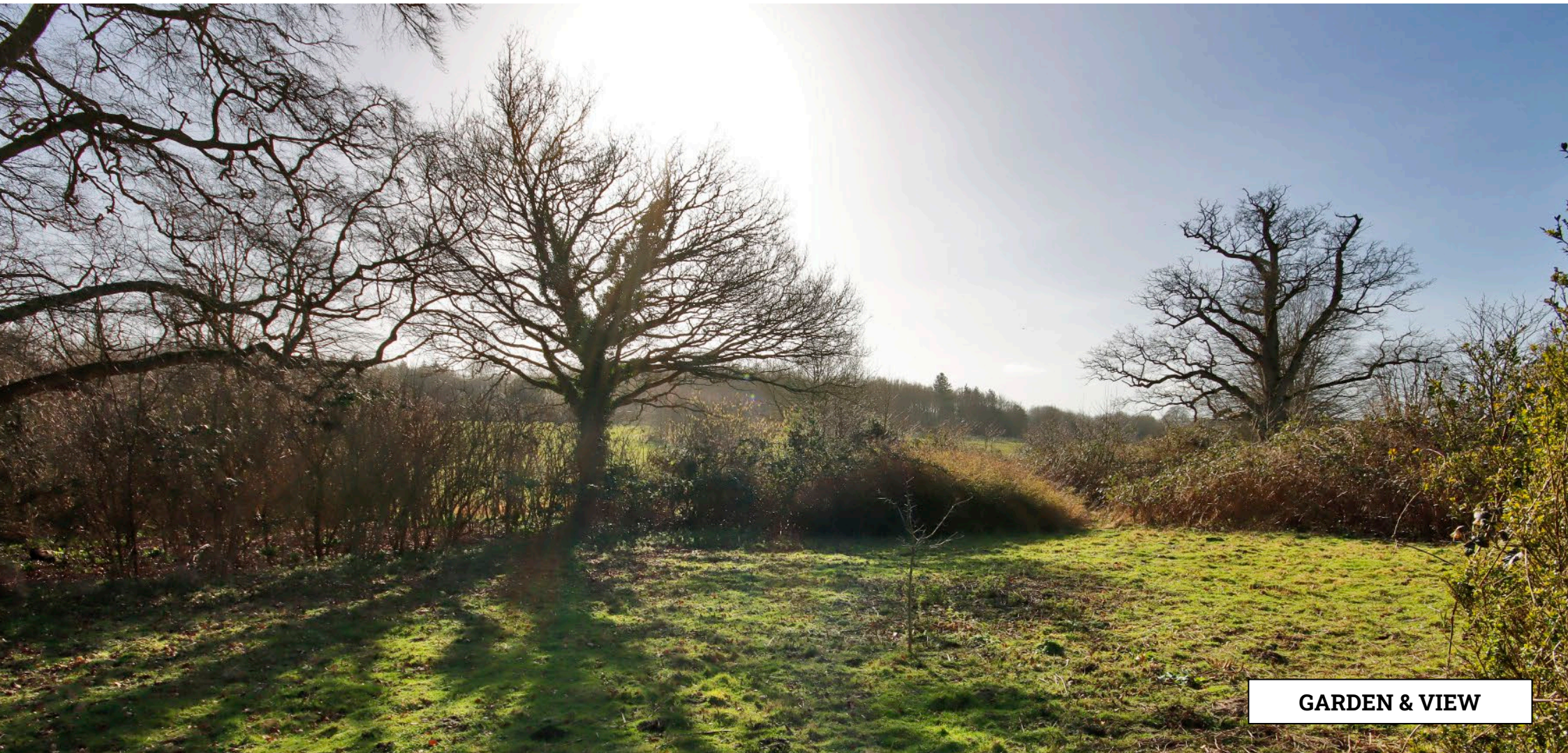
GARDEN & VIEW

The Rear Garden is fully enclosed and surrounds the Cottage, consisting of lawned and bedded gardens throughout along with off road parking for multiple vehicles.