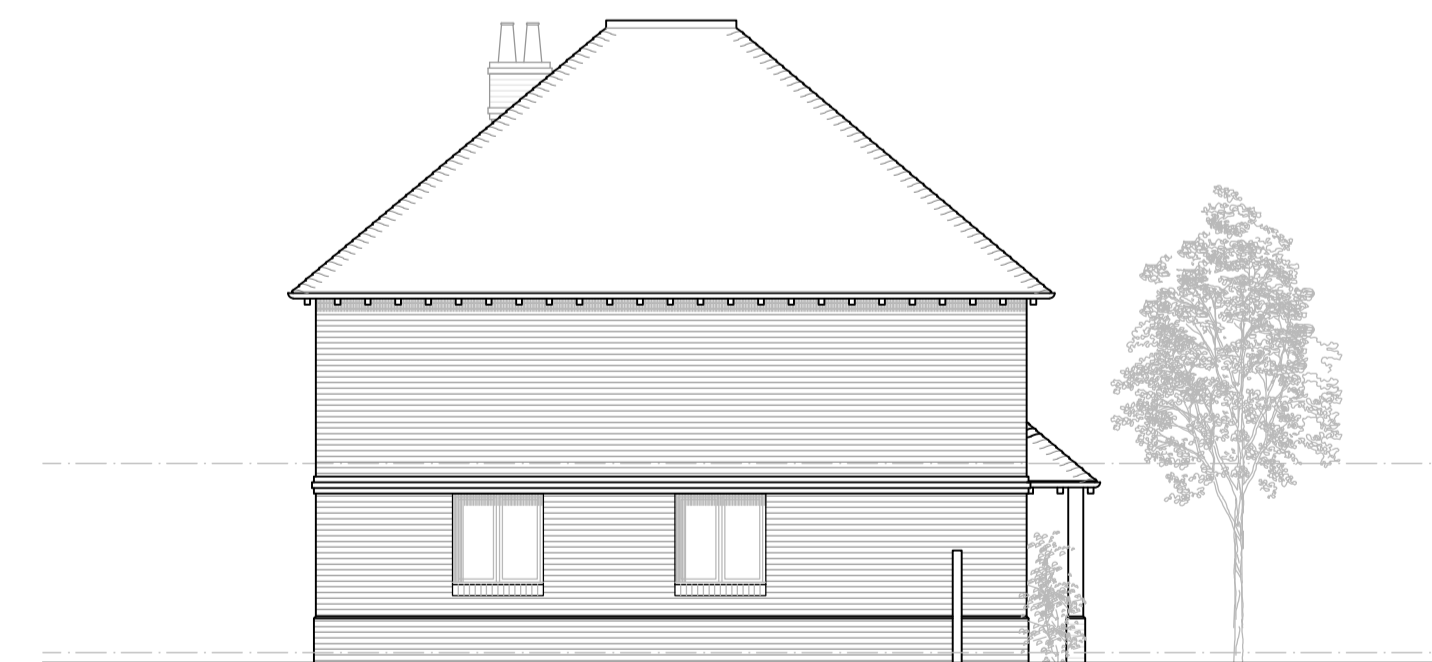
Proposed South Elevation Scale 1:100

Notes Do Not Scale (unless for the purposes of planning). Report all discrepancies, errors and omissions. Verify all dimensions on site before commencing any work on site or preparing shop drawings. All materials, components and workmanship are to comply with the relevant British Standards, Codes of Practice, and appropriate manufacturers recommendations that from time to time shall apply. For all specialist work, see relevant drawings. This drawing is copyright of Kent Design Studio Ltd