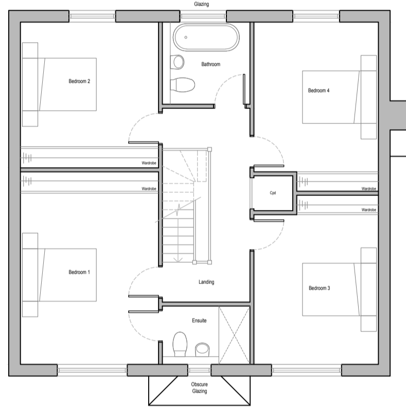
Proposed First Floor Plan Scale 1:100