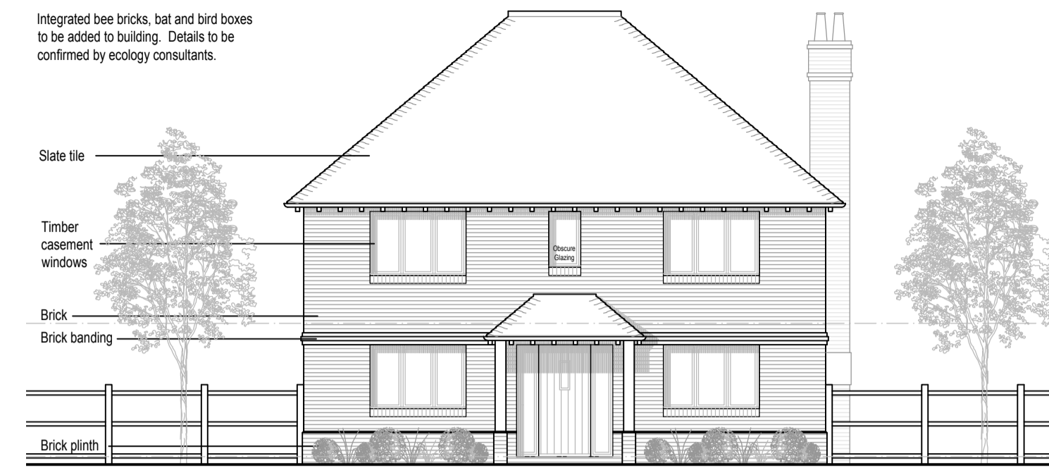
Proposed East Elevation Scale 1:100