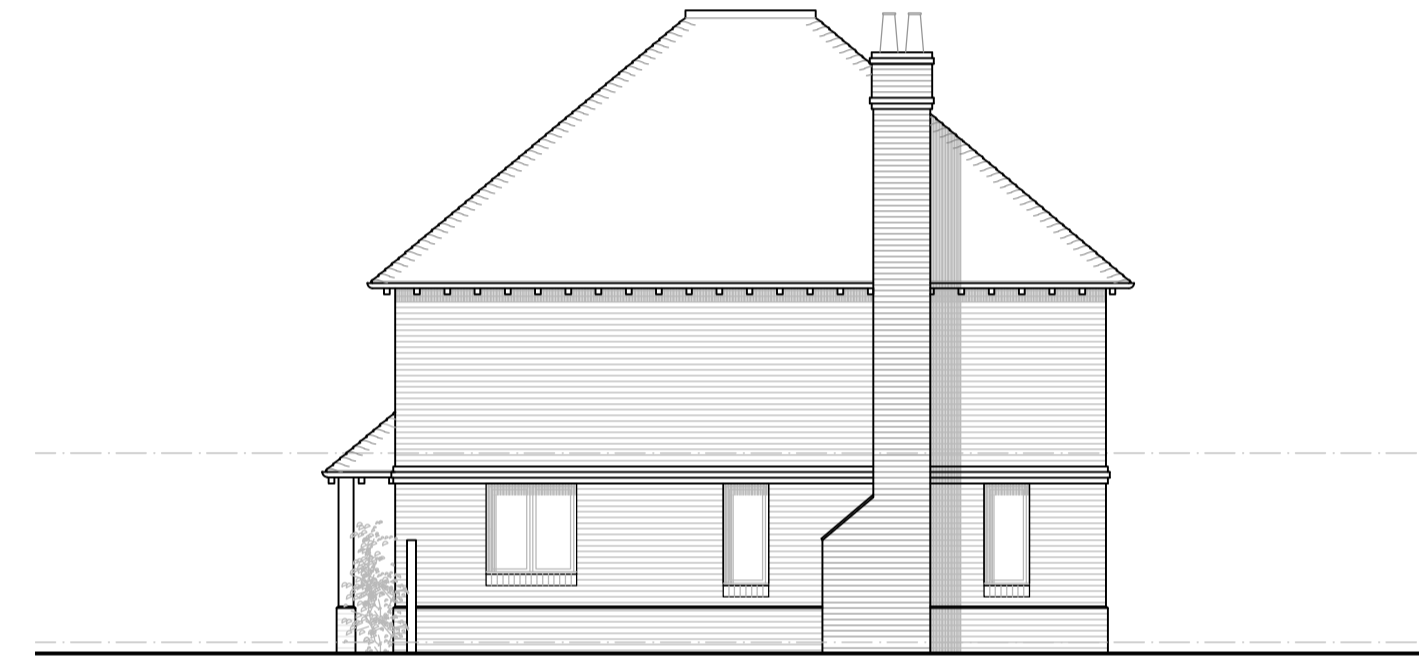
Proposed North Elevation Scale 1:100