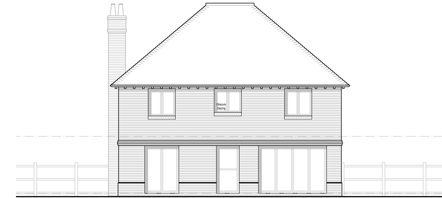
Proposed West Elevation Scale 1:100