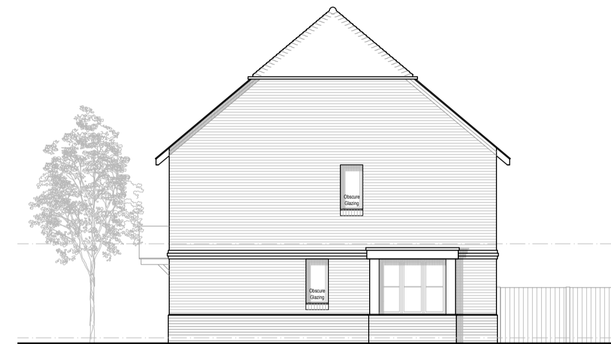
Proposed North East Elevation Scale 1:100