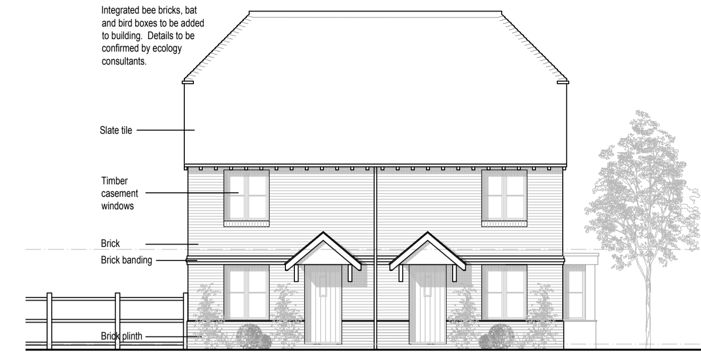
Proposed South East Elevation Scale 1:100