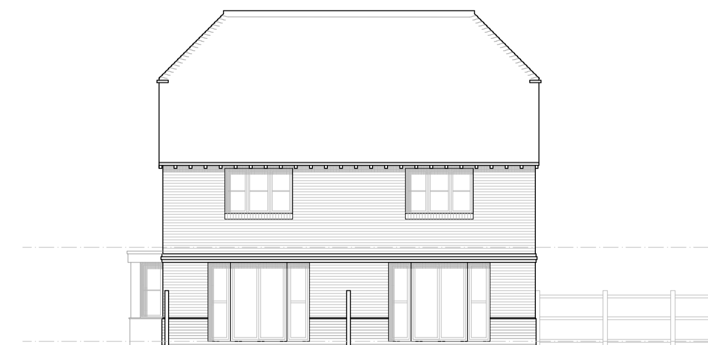
Proposed North West Elevation Scale 1:100

Notes Do Not Scale (unless for the purposes of planning). Report all discrepancies, errors and omissions. Verify all dimensions on site before commencing any work on site or preparing shop drawings. All materials, components and workmanship are to comply with the relevant British Standards, Codes of Practice, and appropriate manufacturers recommendations that from time to time shall apply. For all specialist work, see relevant drawings. This drawing is copyright of Kent Design Studio Ltd