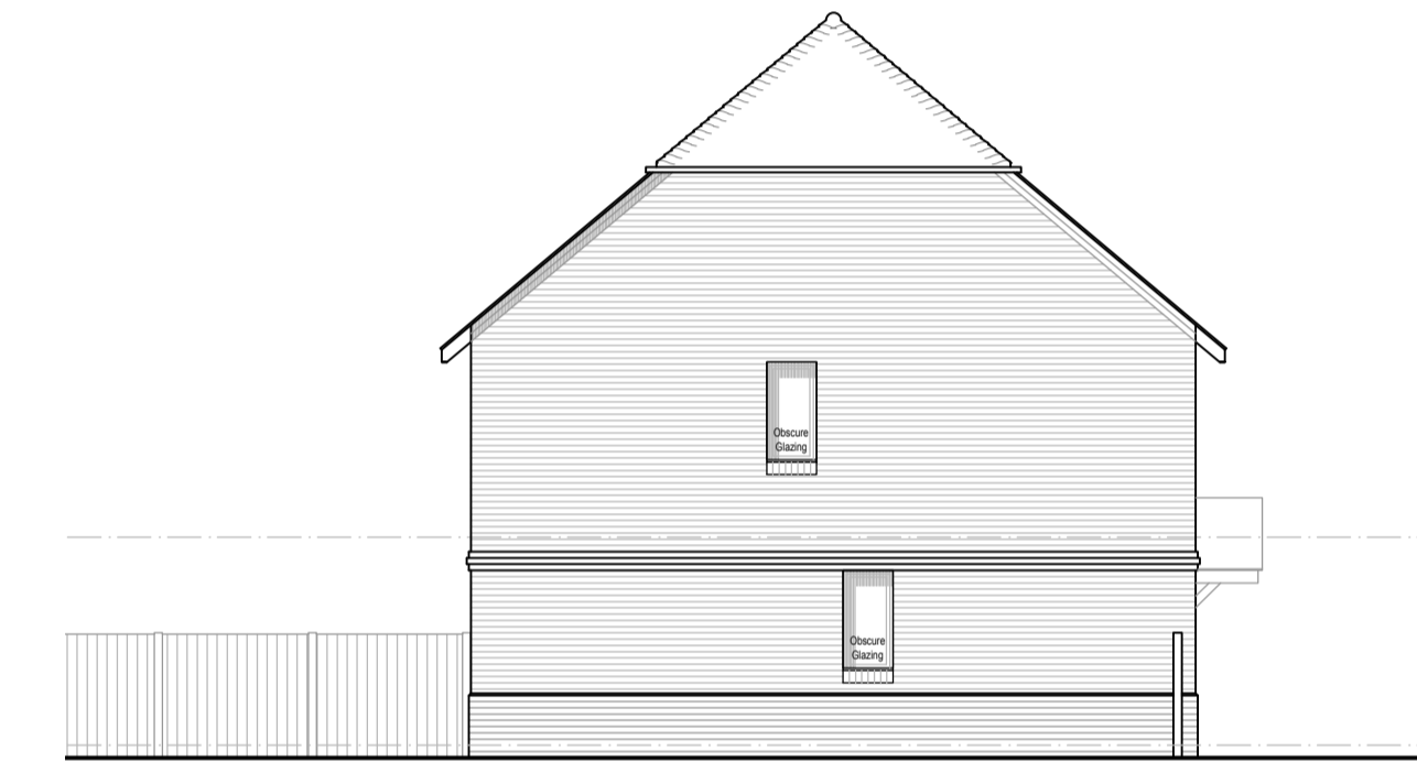
Proposed South West Elevation Scale 1:100