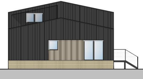
4. Proposed Side Elevation 1:100 @ A2