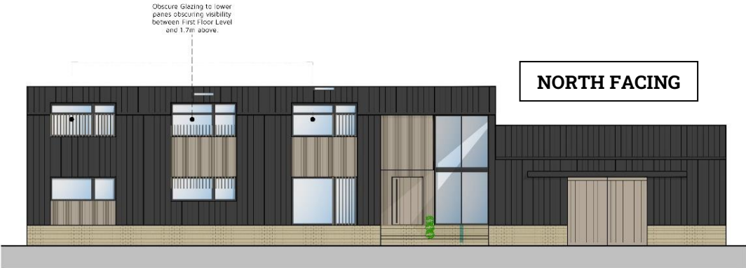
1. Proposed Rear Elevation 1:100 @ A2