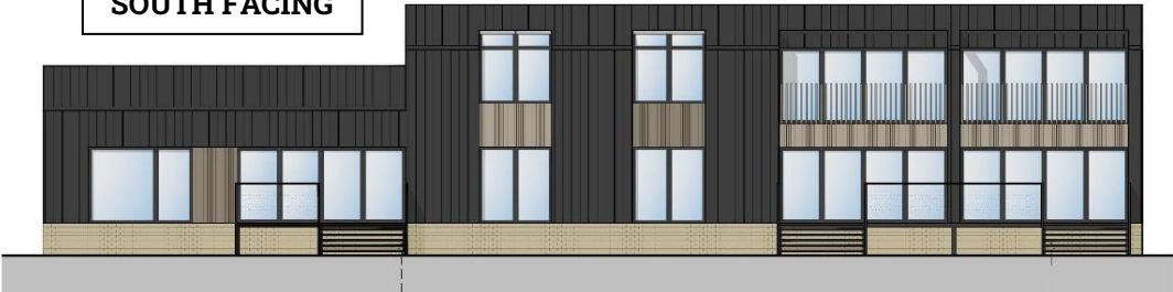
3. Proposed Front Elevation 1:100 @ A2