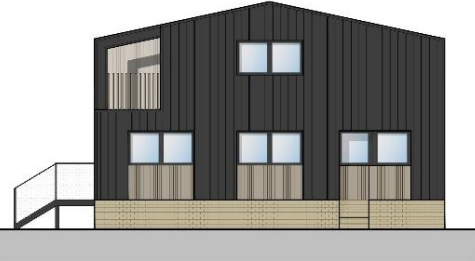
2. Proposed Side Elevation 1:100 @ A2