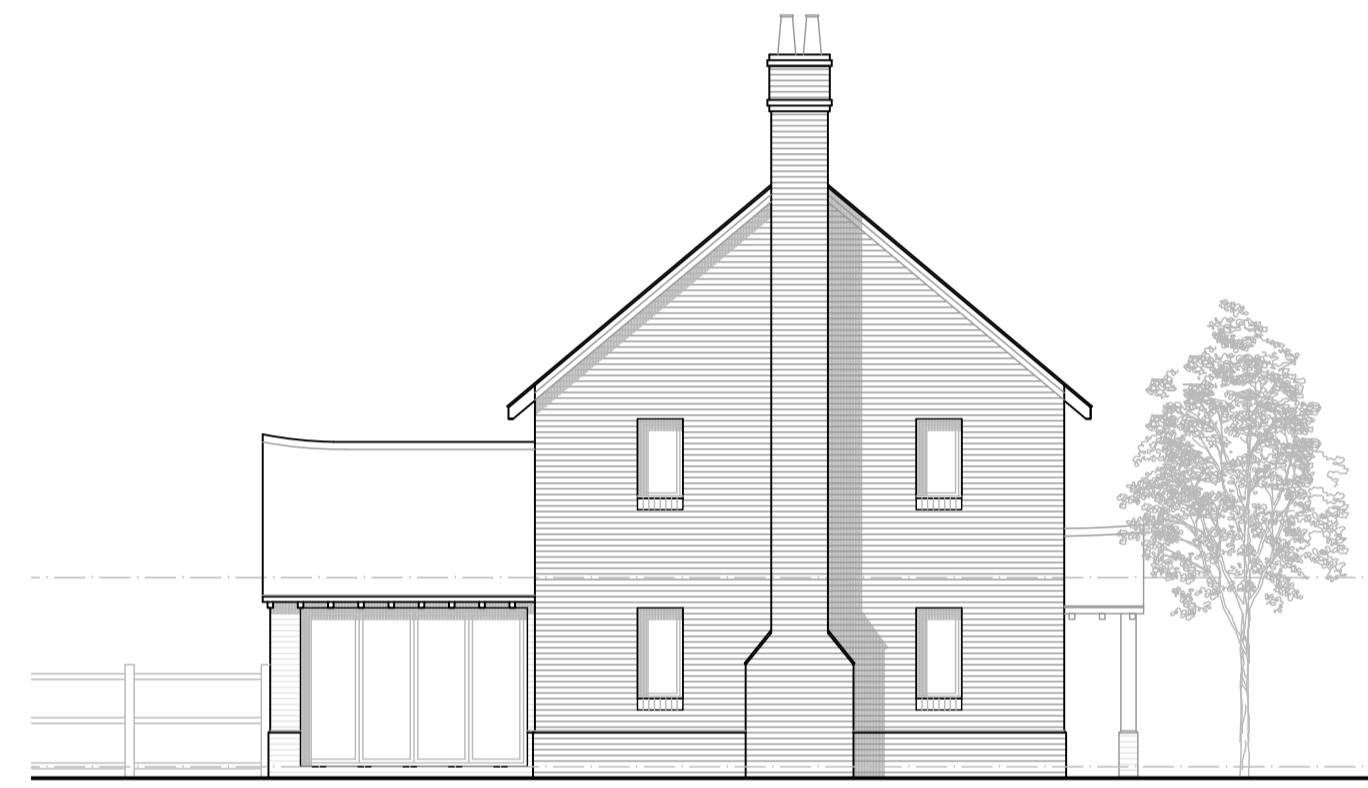
Proposed South East Elevation Scale 1:100