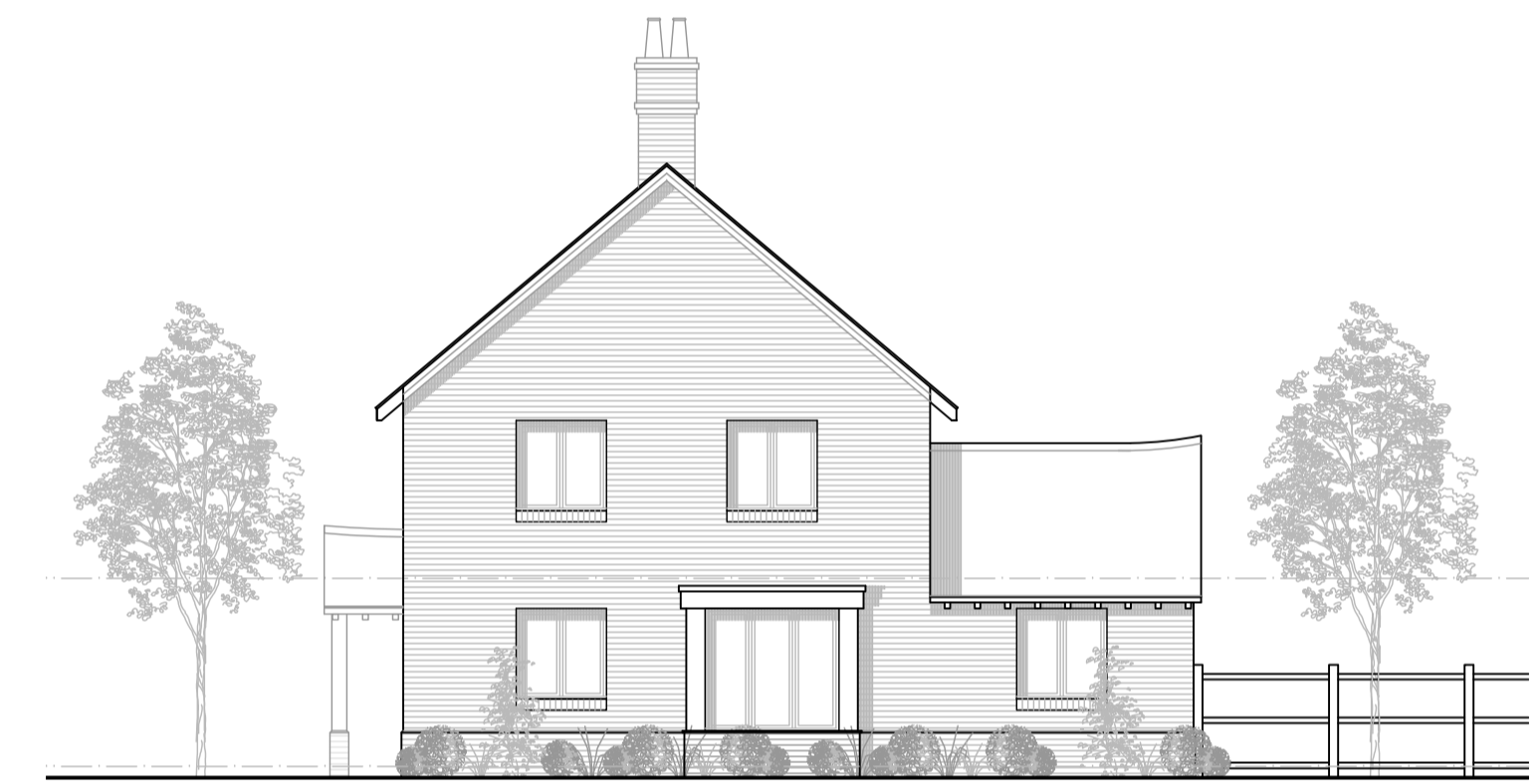
Proposed North West Elevation Scale 1:100