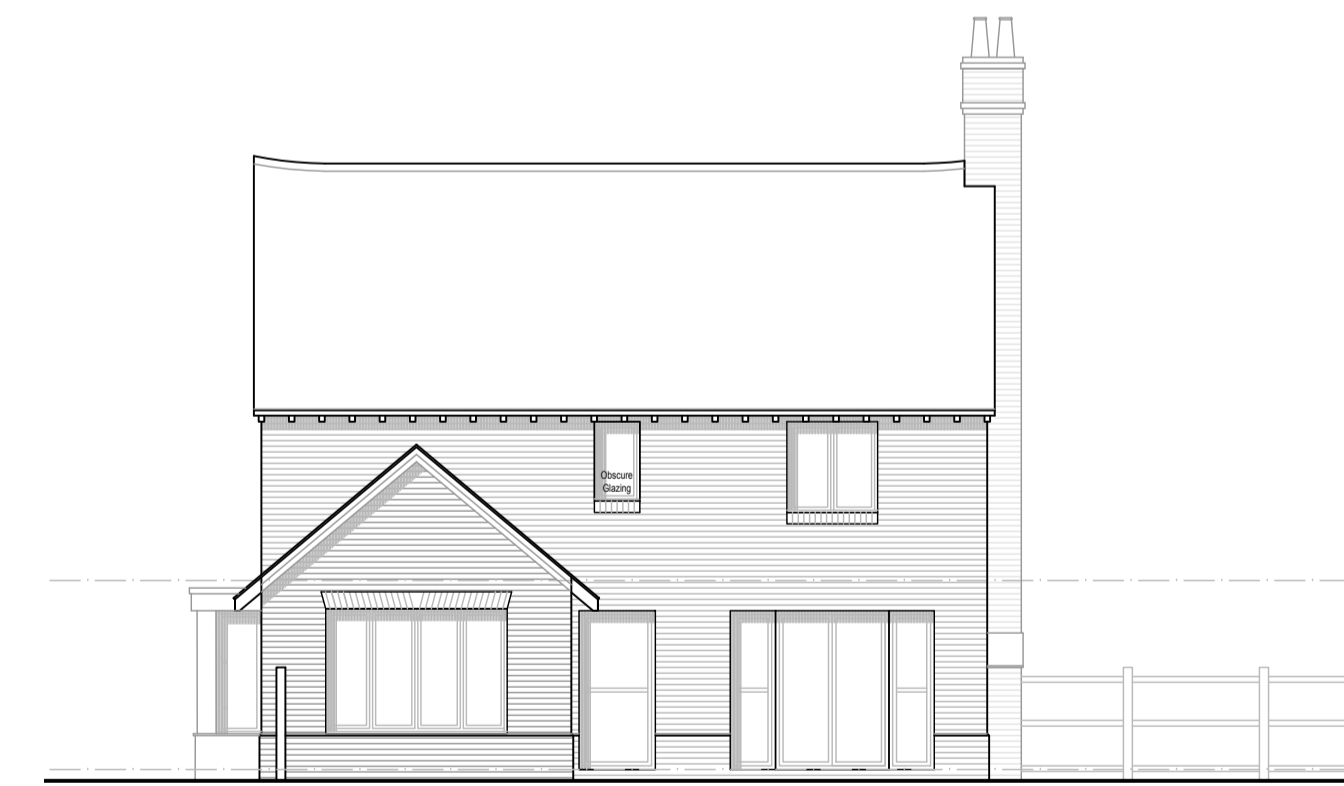
Proposed South West Elevation Scale 1:100

Notes Do Not Scale (unless for the purposes of planning). Report all discrepancies, errors and omissions. Verify all dimensions on site before commencing any work on site or preparing shop drawings. All materials, components and workmanship are to comply with the relevant British Standards, Codes of Practice, and appropriate manufacturers recommendations that from time to time shall apply. For all specialist work, see relevant drawings. This drawing is copyright of Kent Design Studio Ltd