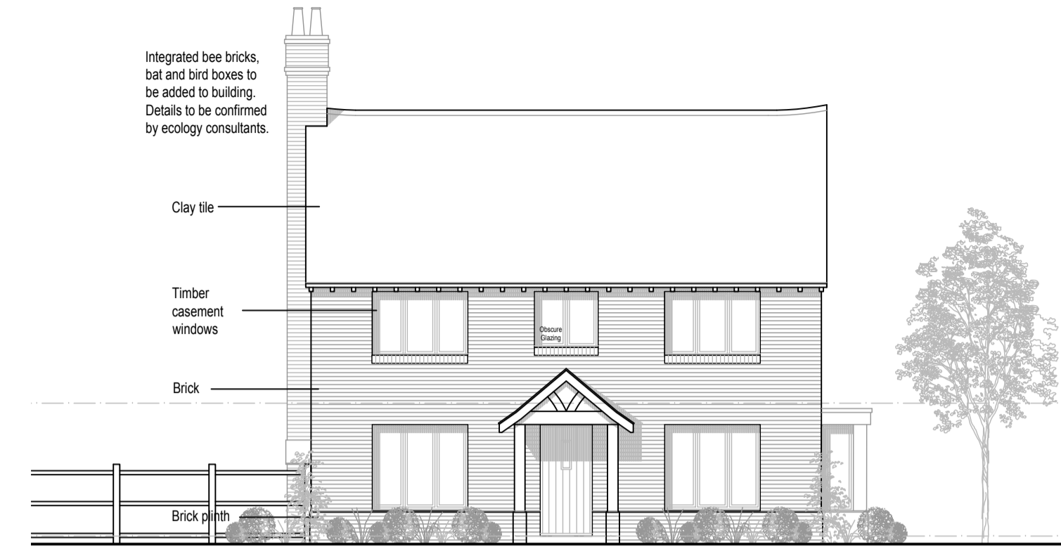
Proposed North East Elevation Scale 1:100