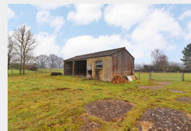
Ulcombe, Kent Guide Price - £550,000