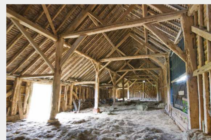
East Sutton, Kent Guide Price - £575,000

There are a number of requirements prior to obtaining planning permission to convert including; the barns use prior to submission, location, structure and accessibility. BTF's dedicated team work with landowners to ensure the best possible outcome from applications and how to market the limitless potential.